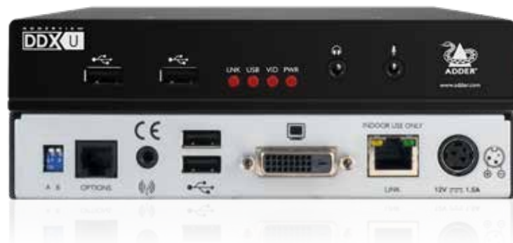
Pictured above: ADDERView DDX USR. User module (receiver) front and back

Unshielded cables are not suitable for the DDX. Distances are achieved using single lengths of SFTP trunk/bulk cable with two 3 meter SFTP patch cables. For each additional break/patch connection reduce distance by 5 meters. Patch cables must be SFTP.